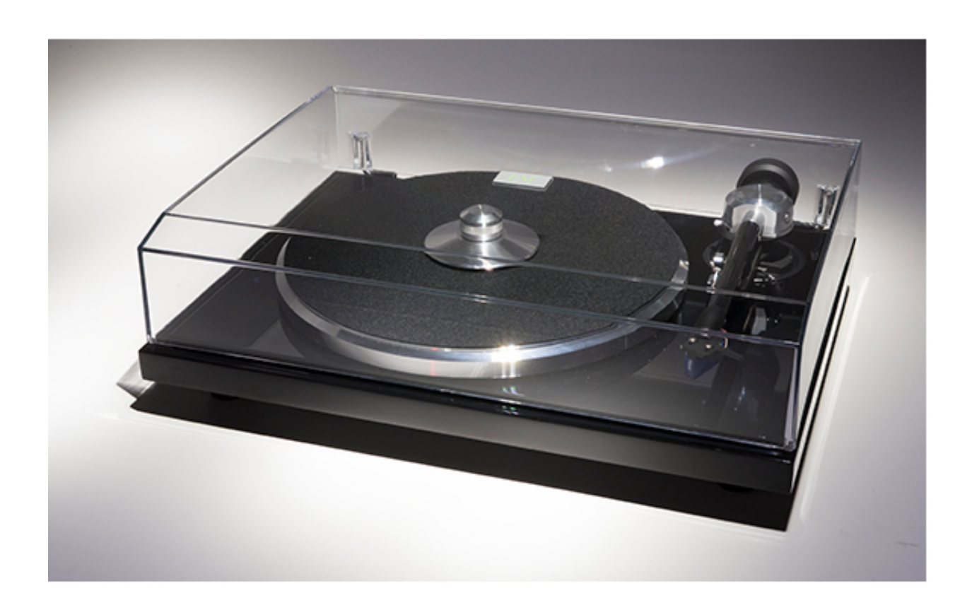
The EAT B-Sharp $1,595 with Ortofon 2M Blue (installed) www.vanaltd.com

One of the toughest parts of participating in the wacky world of analog is agonizing over cartridge choice, and equally so, cartridge setup. That US Importer VANA handles this tough choice for you is not only welcome, but a great way to get you listening to records right now, rather than sweating the rest.