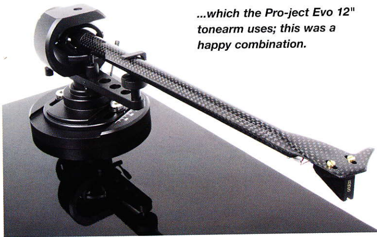
...which the Pro-ject Evo 12" tonearm uses; this was a happy combination.

equivalent of a turbocharged eighties Bentley.